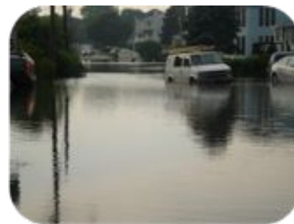
Photo Taken at the corner of Atlantic Ave and Uzzi Ave.

still impassable causing the cancellation of the Fun Run that evening. Below you can find a collection of photos of the Fun Run course taken on the evening of July 1, 2009.